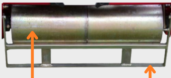
Two segment rear roller with automatic diff gives a smooth drive which results in positive traction and control without bruising the turf