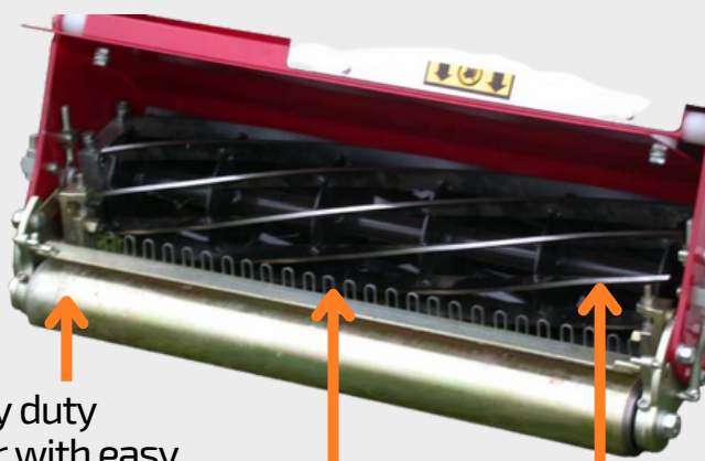
New heavy duty front roller with easy height adjustment