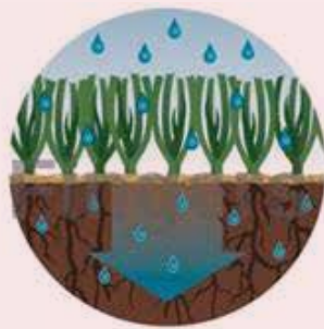
After application of wetting agent

Stamina Express has an excellent ability to reduce the cohesive forces of water, lowering its surface tension and shearing droplets into smaller ones, allowing it to penetrate into the soil rapidly. By doing this, losses due to evaporative forces are reduced, resulting in the maximum volume of water entering the soil. The residual surfactant component ensures excellent rewetting capability in the initial weeks following the application.