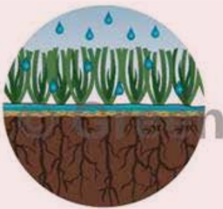
Before wetting agent is applied