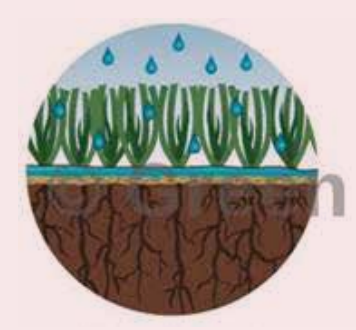
Before wetting agent is applied