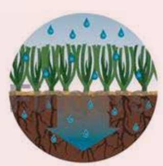
After application of wetting agent

Stamina Express has an excellent ability to reduce the cohesive forces of water, lowering it's surface tension and shearing droplets into smaller ones, allowing it to penetrate into the soil rapidly. By doing this, losses due to evaporative forces are reduced, resulting in the maximum volume of water entering the soil. The residual surfactant component ensures excellent rewetting capability in the initial weeks following the application.