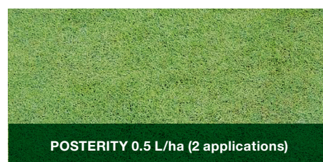
POSTERITY 0.5 L/ha (2 applications)