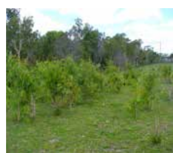
Regrowth under power lines