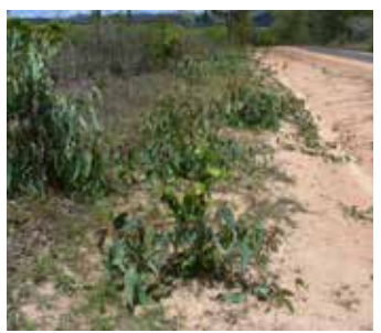
Regrowth on the road side