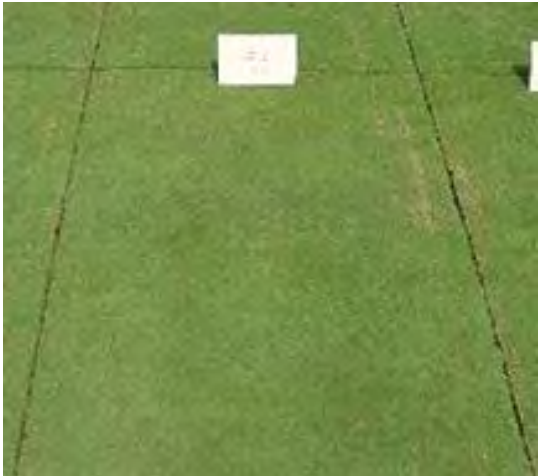
Midas 780g/ha / 28 day