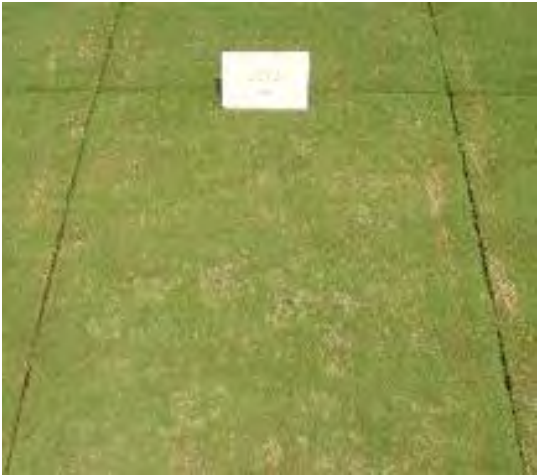
Heritage 1.2L/ha / 14 day