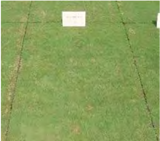
Chipco GT 13L/ha / 14 day