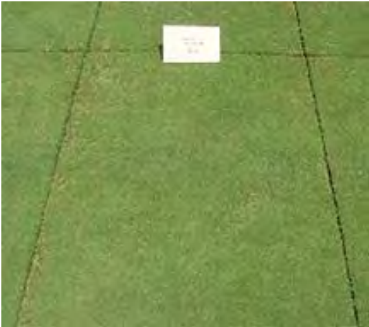
Midas .780g/ha / 21 day