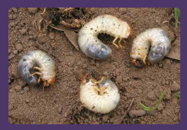
High density scarab larvae populations found beneath damaged turf.

Turf including golf courses, bowling greens, sports fields, race tracks, recreational lawns and turf farms.