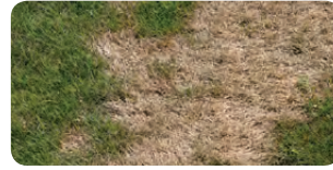
Seedling Damping Off