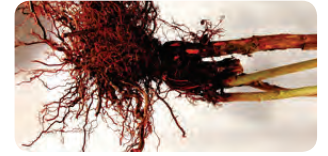
Crown and Root Rot