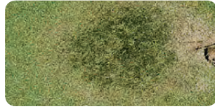
Pythium Root Rot