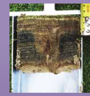
FIG 1. Black layer present, golf green ir Melbourne.